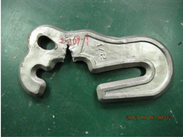
Sample 1# after test