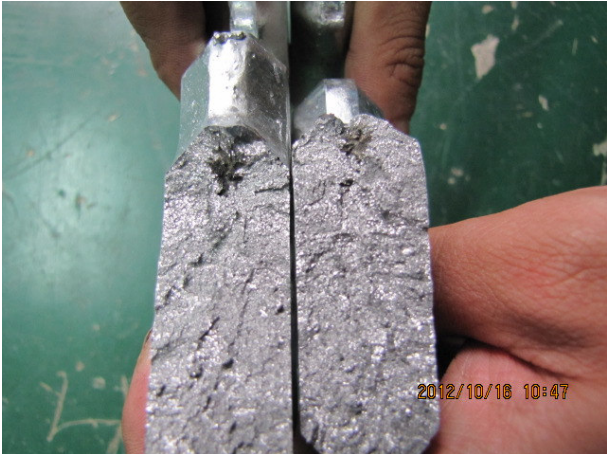
Sample 2# after test