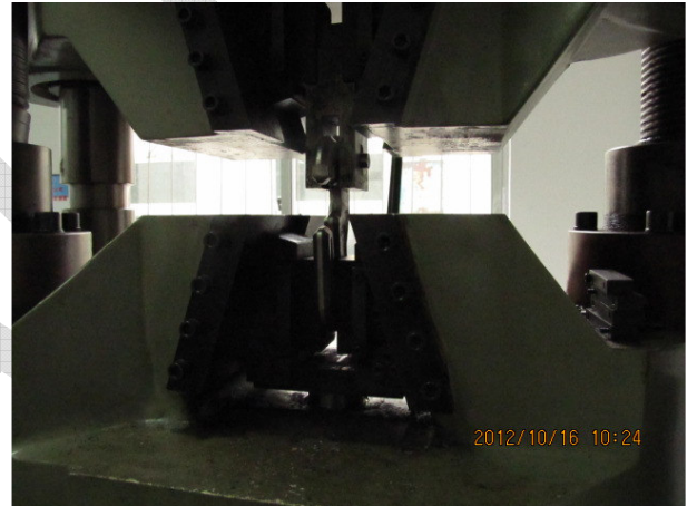
Sample in test