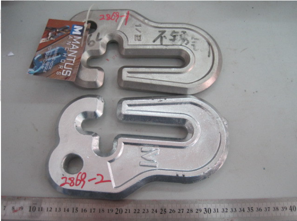
Sample before test