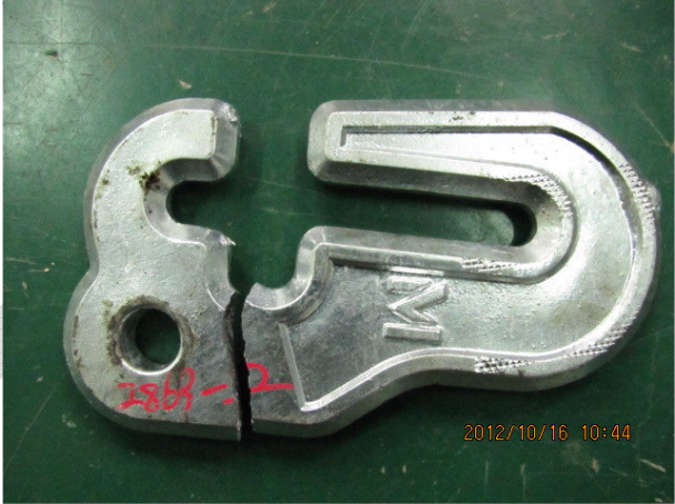
Sample 2# after test